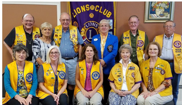
The Maryville Lions Club—they SERVE!