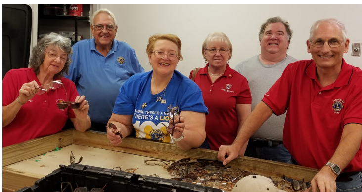
District 12-N takes on the Eyeglass Recycling mission in Roanoke, Virginia