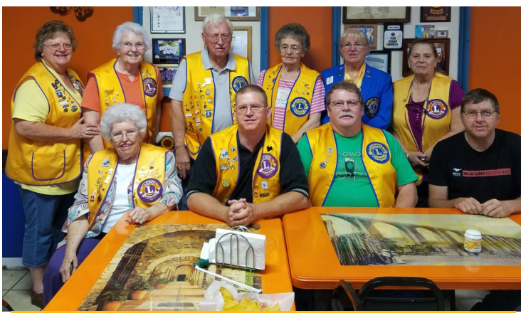
The Bulls Gap Lions Club—serving those in need.