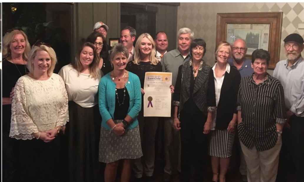
The Downtown Knoxville Lions Club. ROAR!