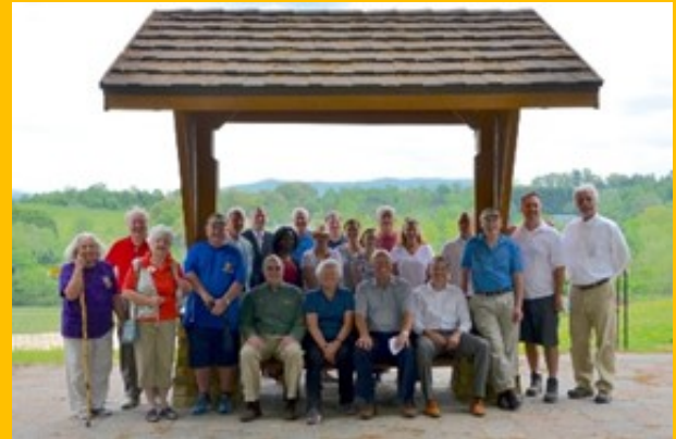
Dedication ceremony crowd of Lions and city officials from Elizabethton and Johnson City