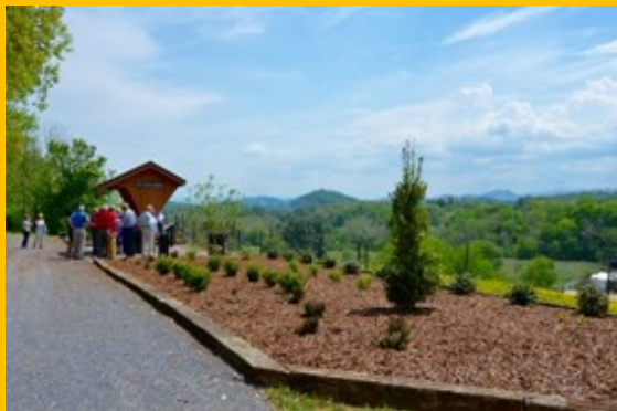
Landscape beds were created and planted by Johnson City Public Works crews