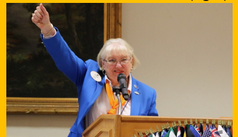
Great Day to be a Lion