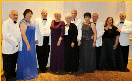
Council of Governors