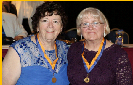
Presidential Recognition Medal