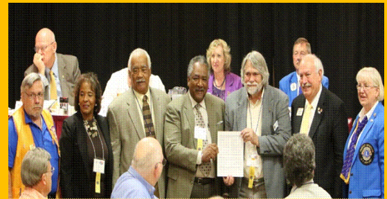
Charter Appl signing – Knoxville East Lions