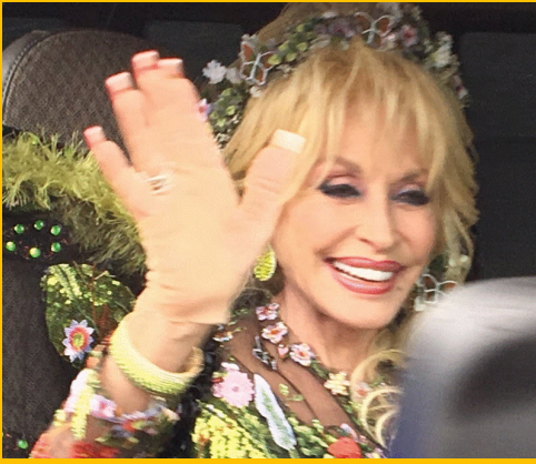
Fridays Parade—Dolly Parton