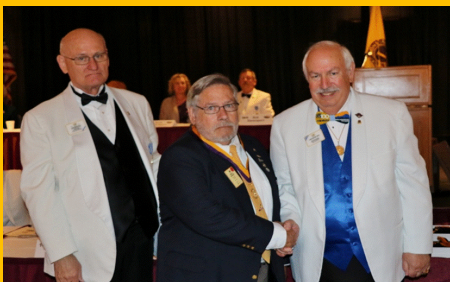
Ambassador of Good Will Award