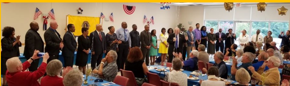
Knoxville East Charter Night