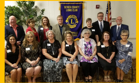
Sevier County Charter Night