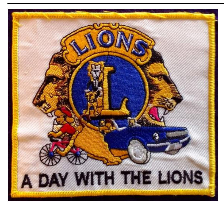
Karns hosts the June 7th 2014 Day with the Lions

DANDRIDGE LIONS CLUB 34th ANNUAL GOLF TOURNAMENT WEDNESDAY, JULY 31, 2013 DANDRIDGE GOLF AND COUNTRY CLUB