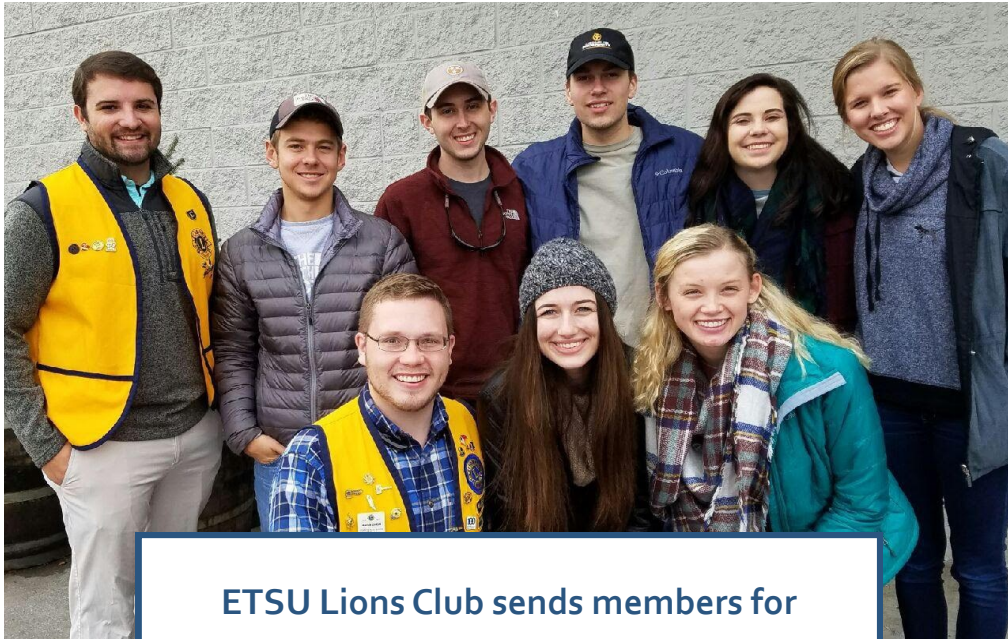
ETSU Lions Club sends members for Gatlinburg relief efforts.