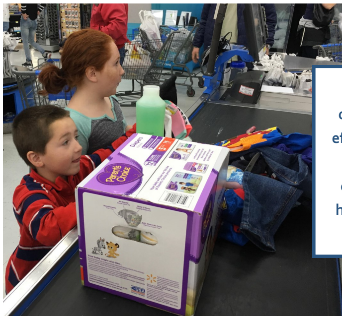
Lions Clubs disaster relief efforts will help hundreds of children who have lost their homes.