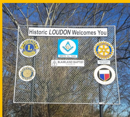
Loudon Welcome Sign