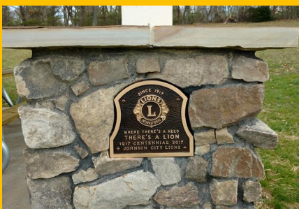
Johnson City Picnic Pavilion