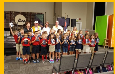
North Knox - Dictionary Program