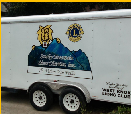
West Knox Vision Van Signage