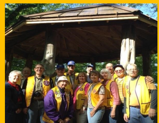
Norris Lions Observation pavilion