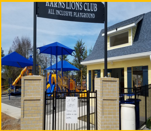
Karns All-Inclusive Handicap Playground