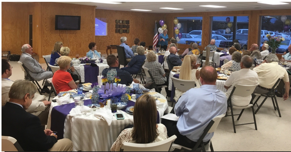
A packed house at the Campbell County Lions Club